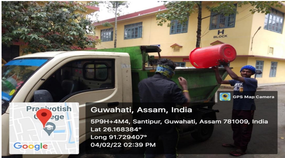
GMC GARBAGE COLLECTING VAN